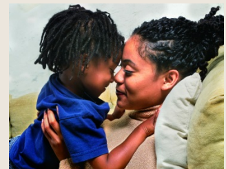
Lots to Celebrate in May! Mothers' Day, Armed Forces Day, Graduations, Memorial Day. Enjoy time with your family and friends and the unofficial kick off to summer!

Encourage kids to do something – make a card, make a book to read to Mom, plant a flower in a decorated pot, make anything with a kid's handprint on it. Make a circle of handprints and draw a stem a leaves for a flower for Mom. Take photos while the kids make cookies and put one in a frame. (This only works if you clean the kitchen, too.) Take Mom out to breakfast or lunch, even if it involves unwrapping food and a plastic toy. Better yet, take the kids to the playground while Mom takes a NAP!