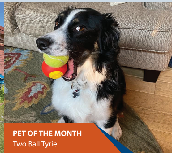
PET OF THE MONTH Two Ball Tyrie